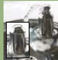
Safe Stream bubbler™