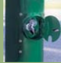
Recessed hose bibb with lock door